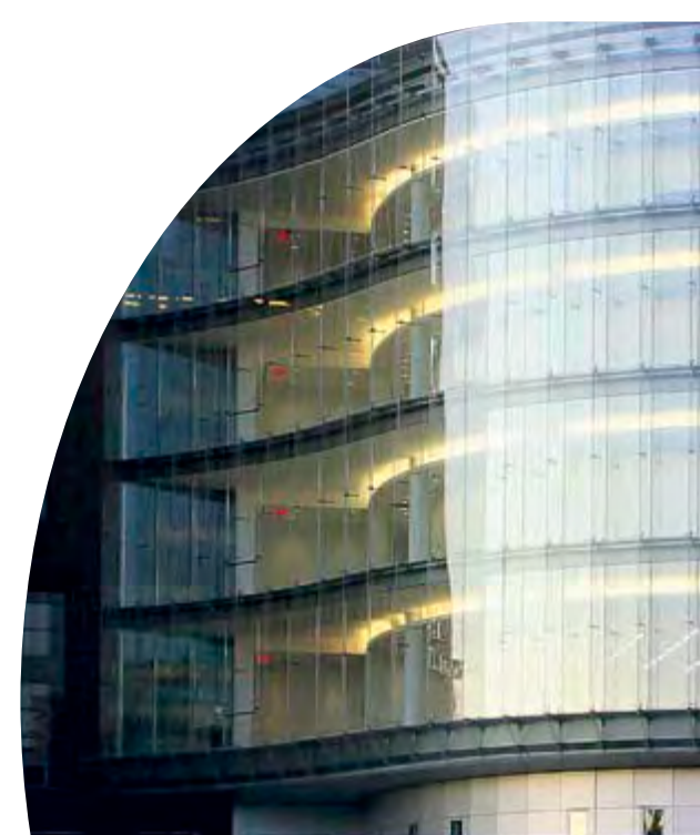
Electronically controlled vertical shades track the movement of the sun, maintaining a temperate internal environment and presenting a constantly changing façade.

The double skin glass construction allows for both energy efficiency and visual transparency.